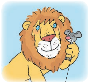
a paw [pɔ:]

The lion opens his eyes. He sees the mouse. “Oh, help! Help!” The mouse is in the lion’s paw! “Please, let me go 1 ! I can help you one day!” “Ha-ha-ha! You are so little! How can you help me? 2 ” The lion is kind and lets the mouse go.