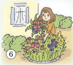
pick flowers ['flaʊəz]