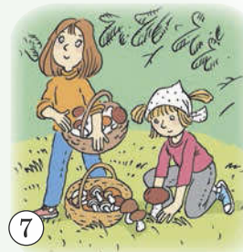
pick mushrooms ['mʌʃru:mz]

1b. Look at the pictures in ex. 1a and say: What is there in the country? What can we do in the country?