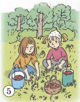
pick berries ['beriz]