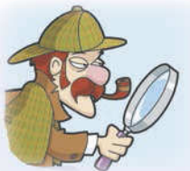
a detective [dɪ'tektɪv] film