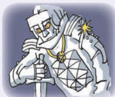
a fantasy ['fæntəsi] film