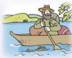
an adventure [əd'ventʃə] film