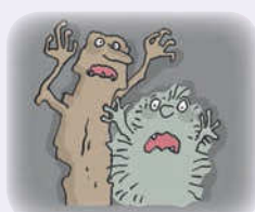
a horror ['hɒrə] film