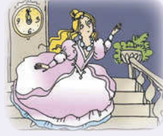
a fairy tale ['feəri ,teɪl]