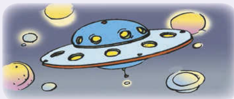
a science fiction [ˌsaɪəns 'fɪkʃ(ə)n] film