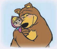
a sitcom ['sɪtkɒm]