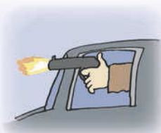
an action ['ækʃ(ə)n] film