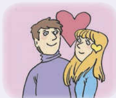
a romantic [rəʊ'mæntɪk] film