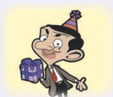
a comedy ['kɒmədi]