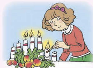
light [laɪt] candles

2a. Speak to your classmate. Answer the questions: What do you both like doing?