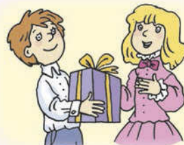
get presents ['prez(ə)nts]