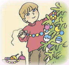
decorate ['dekəreɪt] ... with