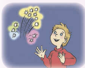
watch fireworks ['faɪəwɜ:kz]