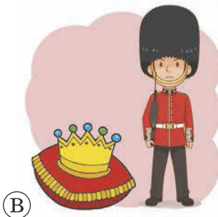
(B) the Queen's Official Birthday