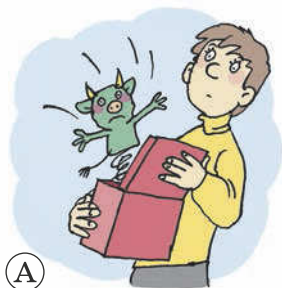
(A) April Fool's Day

1a. 📻 🎧 Listen and read the texts. Match them with the pictures. Where do people celebrate the holidays?