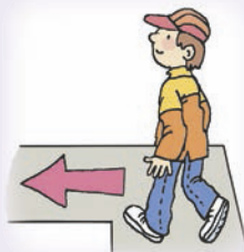
turn [tʊ:n] left