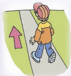
go straight ahead [ˈstreɪt əˈhed]