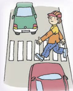
cross the street