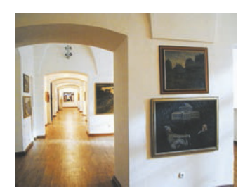
the Art Gallery