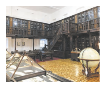
the Museum-Library of Simeon of Polotsk