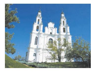
St Sofia Cathedral

in a convent<sup>1</sup>. There she copied church books and then gave money to poor people. She built some churches and monasteries<sup>2</sup> in Polotsk and opened a school for children in the convent.