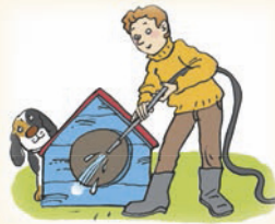
wash a dog house