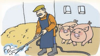
clean a pigsty ['pɪgstɑː]