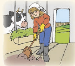
clean a cowshed ['kaʊʃed]