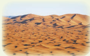
a desert ['dezət]