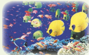
an ocean ['əʊʃn]