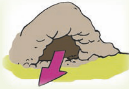
go out of