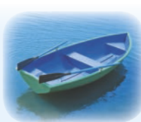
a boat [bəʊt]