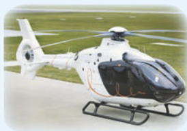
a helicopter [ˈhelɪkɒptə]