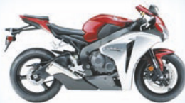
a motorbike ['məʊtəˌbaɪk]