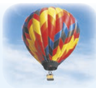
a hot-air balloon