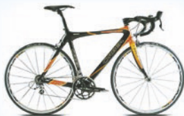
a bicycle ['baɪsɪkl]