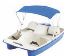
a pedal boat