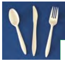
a plastic spoon, fork and knife