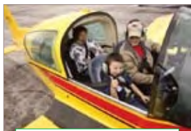
plane rides for children