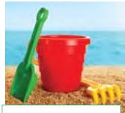
a spade, a bucket and a rake