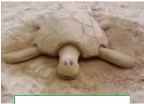
a sand sculpture

b) Write one or two more things you need for these activities.