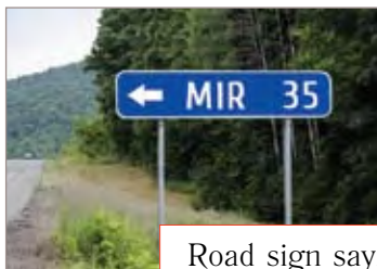
Road sign saying: Mir — 35 km

b) Read the text and choose the title for every part of the text from this list.