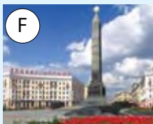
Victory monument in Minsk