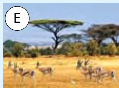
Animals in a national park in Kenya