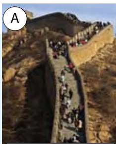
The Great Wall

2. a) Look at the pictures of places. Match them with the names of capitals in ex. 1.