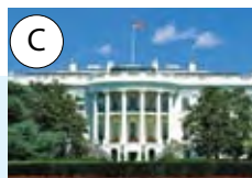
The White House, Washington