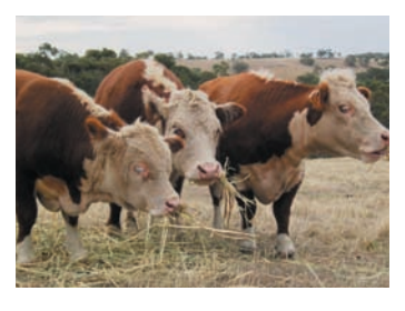
cattle in Australia

very warm and really good for winter wear.